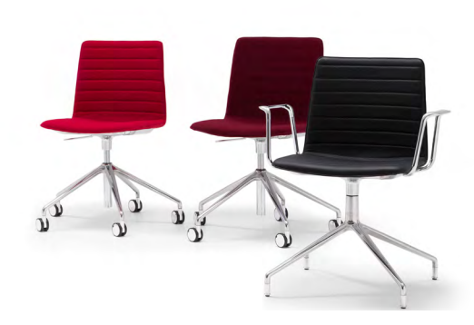
Flex High- Back